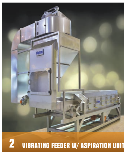
2 VIBRATING FEEDER W/ ASPIRATION UNIT