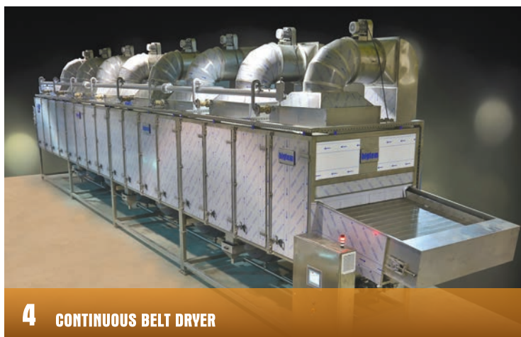
4 CONTINUOUS BELT DRYER