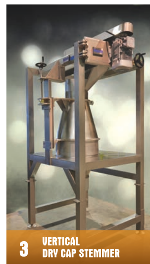
3 VERTICAL DRY CAP STEMMER