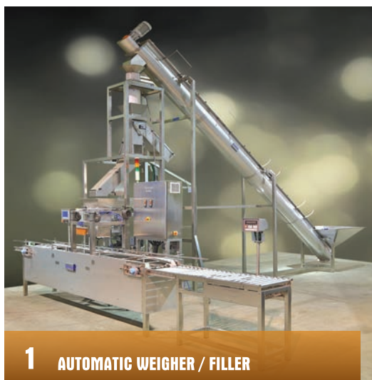
1 AUTOMATIC WEIGHER / FILLER

*Turkey, Chile, U.K., Germany, Holland, Canada, Italy, Greece, Uzbekistan, India, Iran, Russia, Azerbaijan, Afghanistan, China, Australia, Czech Republic.