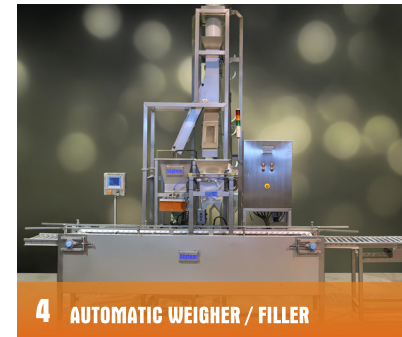
4 AUTOMATIC WEIGHER / FILLER