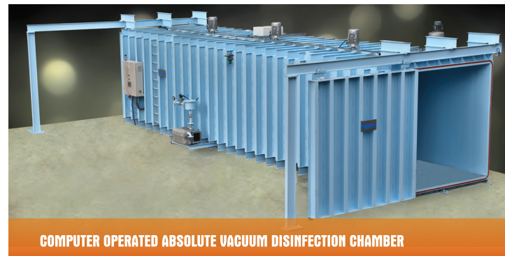
COMPUTER OPERATED ABSOLUTE VACUUM DISINFECTION CHAMBER