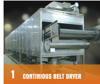
1 CONTINUOUS BELT DRYER

Some clients was happy with bigtem non-clogging drum graders, some liked multi-deck vibrating graders. But all was happy with nonstain conveyors installed dark aflatoxin detection system.