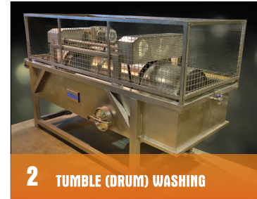
2 TUMBLE (DRUM) WASHING